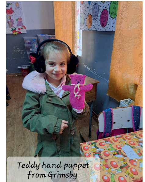
Teddy hand puppet from Grimsby